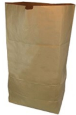
Brown Kraft Bag