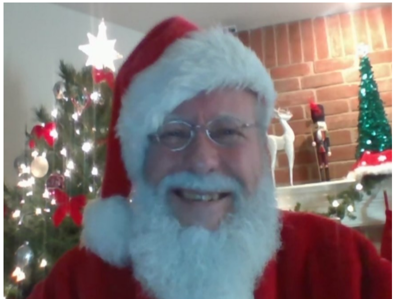
Virtual Santa Visits 2020