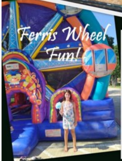
Ferris Wheel Fun!