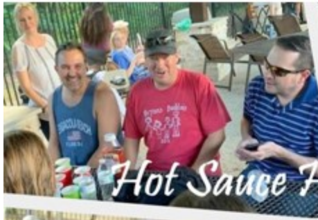
Hot Sauce Heroes!