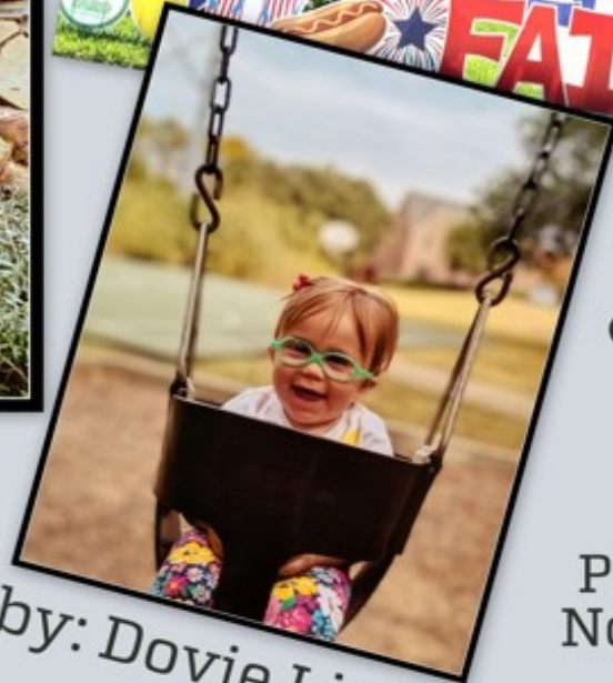
by: Dovie Linton