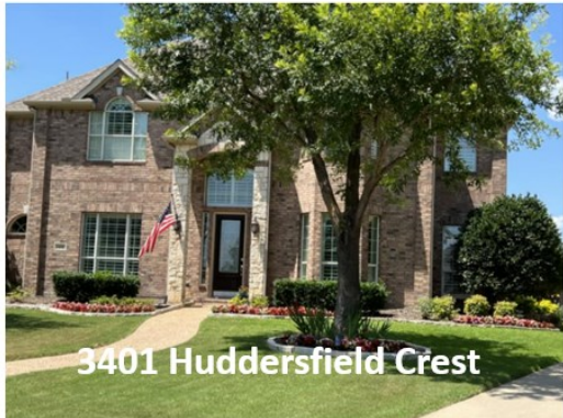
3401 Huddersfield Crest

2023 Yard of the Month winners will be awarded in June, July October & December! Winners receive a $25 gift card from Calloway's.